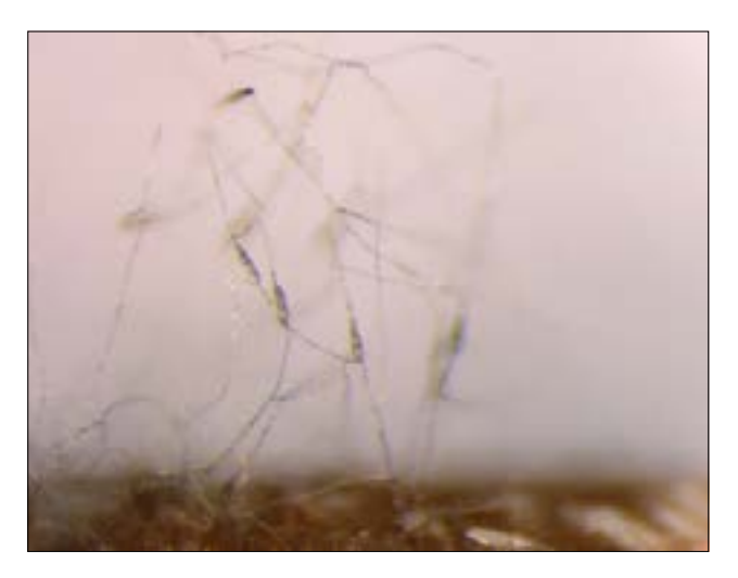
Figure 1. Conidia on rice seed.

Studied in international comparative testing: 1963, 1964