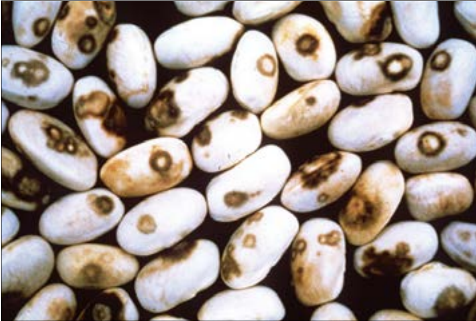
Figure 1. Dry, white bean seeds showing symptoms. Lesions on severely infected seeds may be either brown with whitish centres surrounded by a pale brown to dark brown area, or reddish lesions of variable size. Direct inspection is not considered as a dependable method, as not all infected seeds bear symptoms, and on dark-skinned varieties, symptoms are more difficult to see.