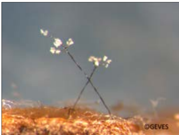
Figure 4. Isolated conidiophores of Botrytis cinerea .