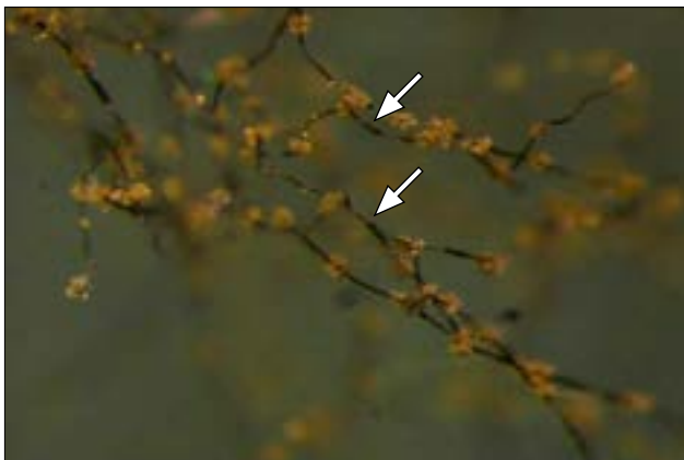
Figure 2. Sporulated mycelium with tape-like hyphae (arrows) of Botrytis cinerea .