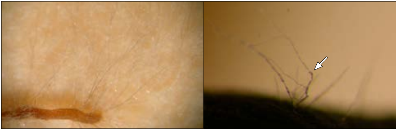
Figure 6. Non-sporulated mycelium of Botrytis cinerea with tape-like hyphae (arrow).