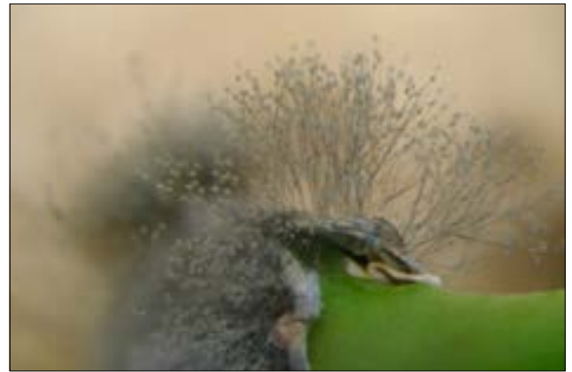
Figure 1. Soft rot of the root with abundant grey mycelium of Botrytis cinerea .