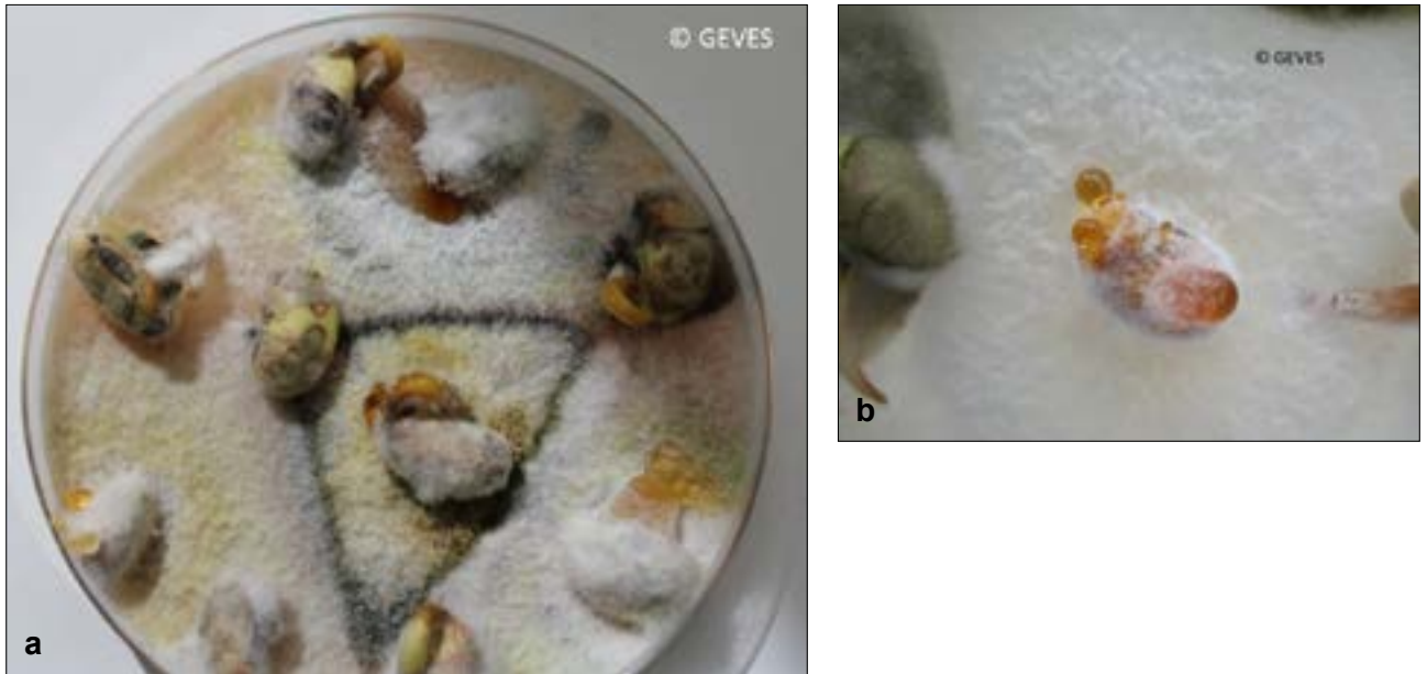
Figure 1. a Colonies of Phomopsis complex on acidified potato dextrose agar. b Exudate on seed.